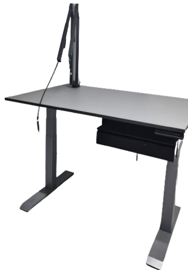
Stylus removed from the workbench